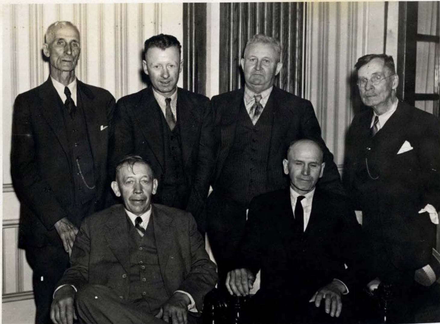
SOUTHWOLD AND DUNWICH TELEPHONE COMPANY DIRECTORS 1939